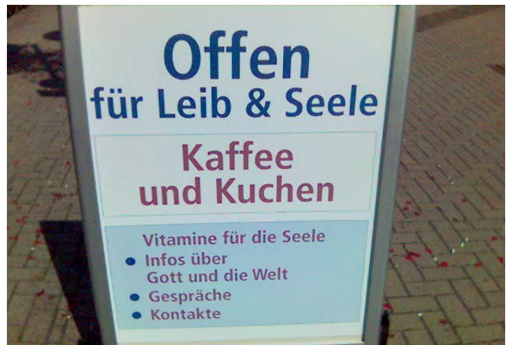
“Open for body and soul; Coffee and Cakes; vitamins for the soul; information about God and the World; conversation and a contact point. Sign outside the Ecumenical chapel and coffee bar at Centro near Oberhausen in the Ruhrgebiet.- Germany’s biggest shopping complex